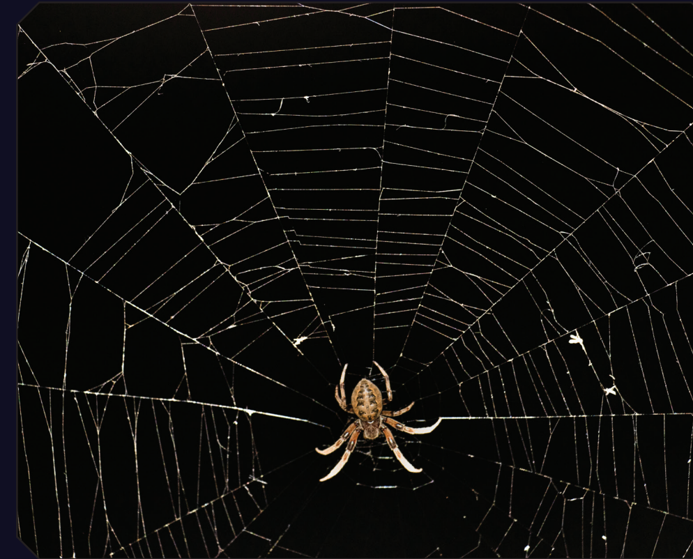
Spiders and other bugs can be found creeping and crawling across the beams and railings of Old Alton Bridge. The bridge, found in a forest, is teeming with wild life.

"Most of the sightings have involved the former working girls from the hotel's days as a bordello," Miss Molly's Hotel about page said.