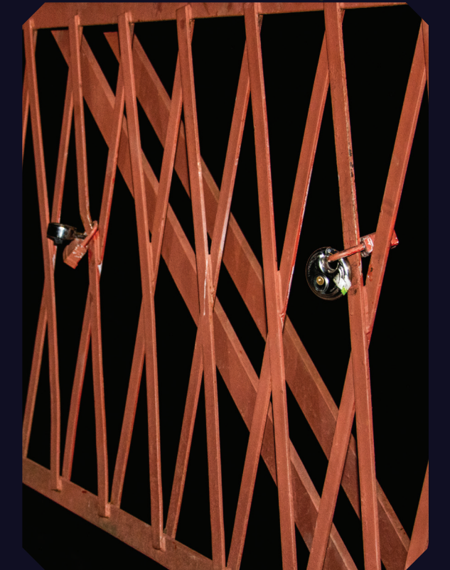
Locks can be found shackled to the bridge railings. These are put there by couples because of a legend started in Serbia signifying love.