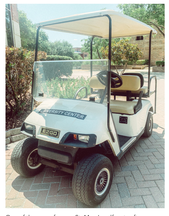
One of the many famous St. Mary's golf carts often seen buzzing around campus. It is a rare sight to see one not in motion. I Photo by Sophia Kussel