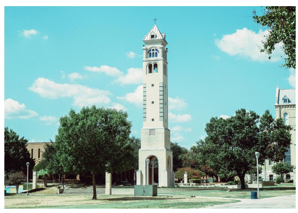
The Barrett Memorial Bell Tower stands tall at the center of St. Mary's University, ringing throughout the day on the hour.

It's now been a month into the Fall 2023 semester, and students are readjusting to life back on campus. Many students have missed their favorite spots over the summer break, but now St. Mary's students have returned to their old stomping grounds for yet another eventful semester. Here are just some of the places we've missed