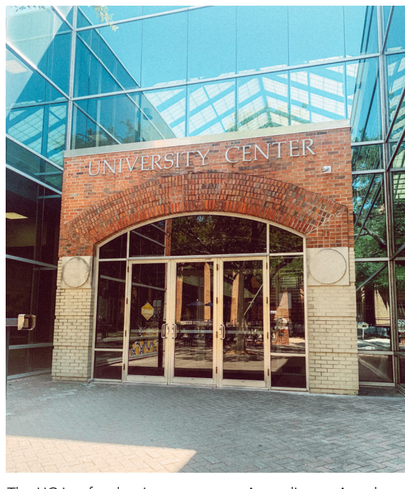
The UC is a focal point on campus. According to Angel Gonzalez, an electrical engineering major, "Everyone is doing their own thing, but everyone still respects people's space."