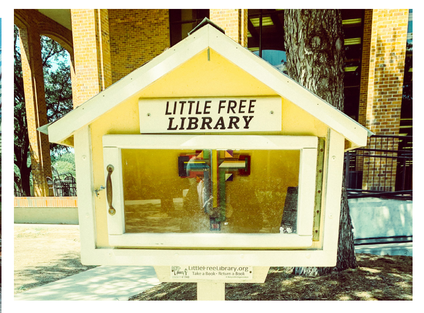
Here we see the Little Free Library outside of the Blume Learning Campus. The golden rule is to take a book, leave a book.l