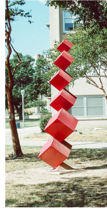
One of the iconic sculpture from the sculpture garden outside Charles Francis Hall