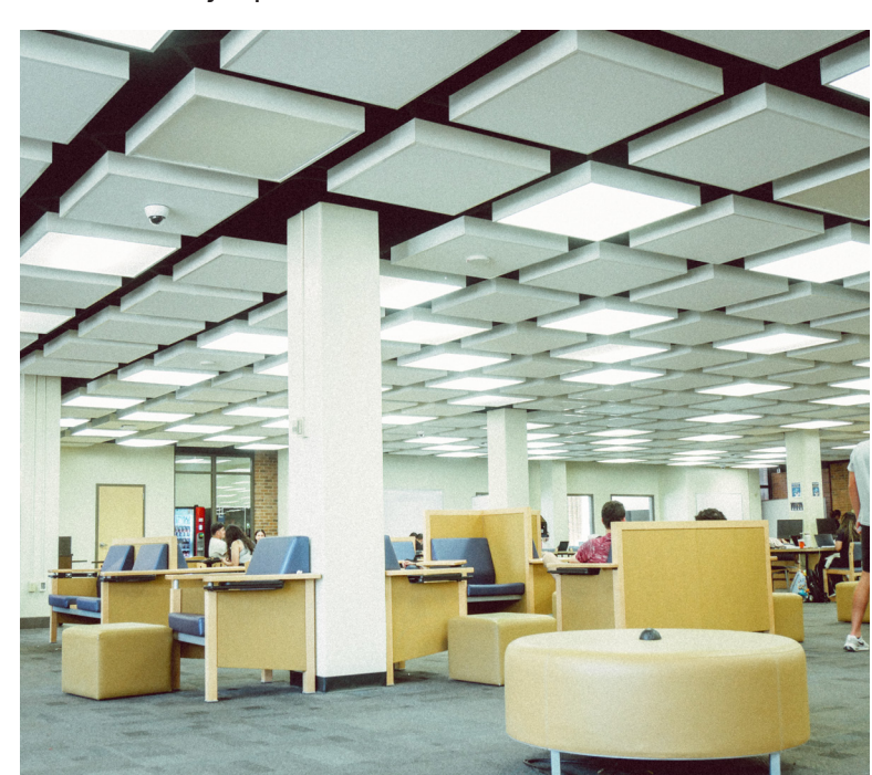
The Learning Commons is another campus favorite, providing an excellent study environment for it's students to socialize. Students are seen fraternizing and preparing for their classes.