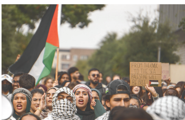
Protestors started off at TI Plaza before marching down the Plinth weaving around campus.