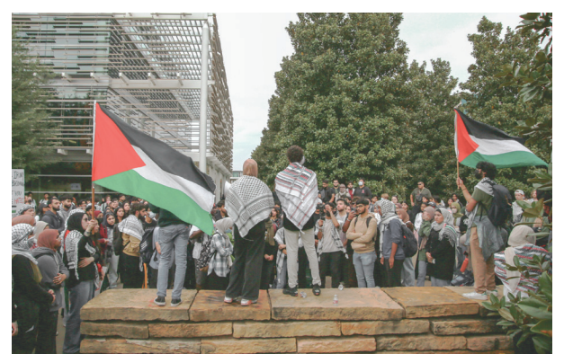
Three marchers spoke about experiences in Palestine and hope for the movement amidst the humanitarian crisis.