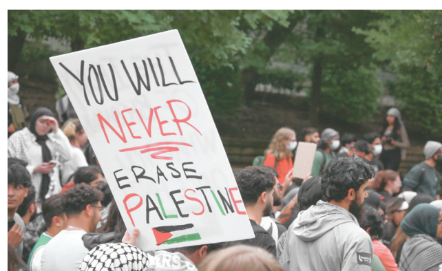
Chants such as "Justice now is our demand. No peace on stolen land," and "Free Palestine" could be heard from UV.