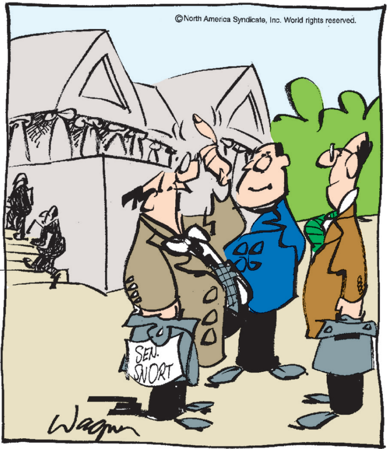
"Always stick to what you believe they want you to say!"