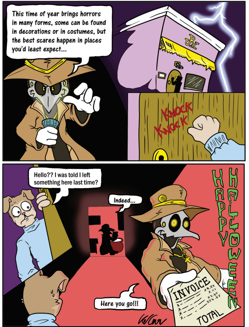
THE PLAGUEDOCTOR by Val Cantu

LIKE TO DRAW? The Foghorn News is looking for talented artists. Stop by GAMB Room D101 for information.