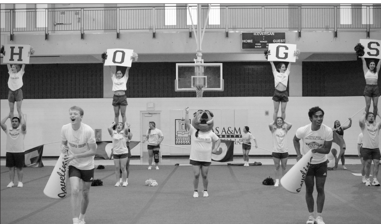
TAMUK cheer practicing the routine they will be performing in Daytona.