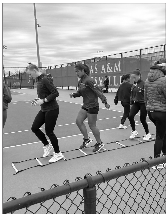
Tennis prepares for Midwestern State match.