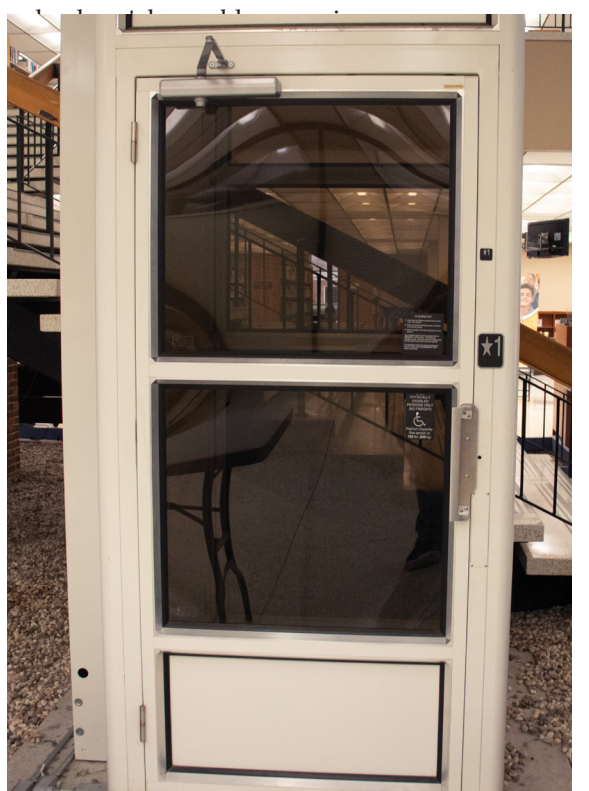
This chair lift is located in the Vaughn Library.