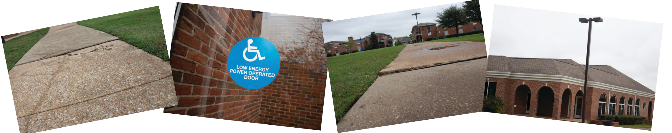
From left: ADA regulations state floor and ground surfaces shall be stable, firm and slip resistant. TJC offers accessible doors with a button. Larry Hatton, director of Facilities and Construction, said in November they will add QR codes to light poles if they need fixing to repair the outage.

Screenshots of the TJC emergency messages that were sent out to all subscribers of the campus alert system at approximately 1:15 p.m. and 3:35 p.m. on Oct. 13 encouraging students and staff to be alert.